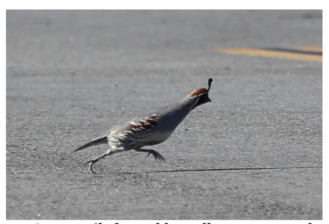
Photo 2. Great-tailed grackle walks onto a rural road in Imperial County, 4 February 2022.